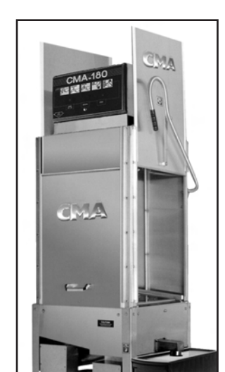
Large 27" door opening accommodates larger items.